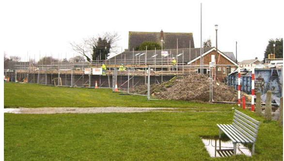
Progress to date on the Changing rooms