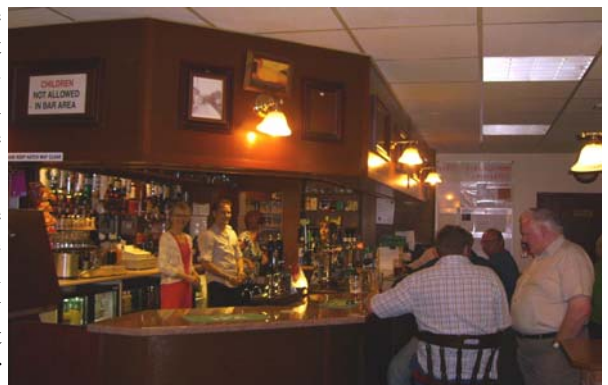
A typical evening in the Hemsby sports & Social Club